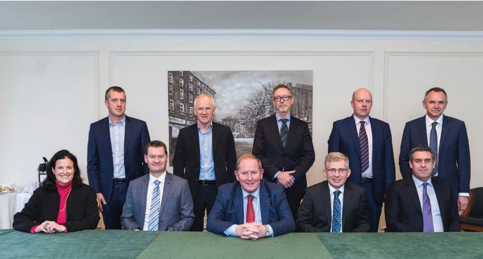
ICF COUNCIL MEMBERS 2022