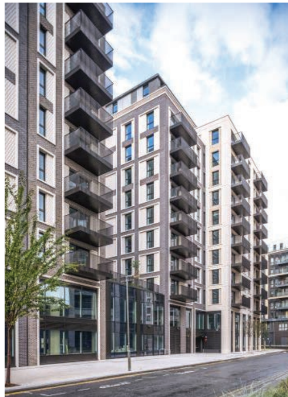
Osiers Road, London

ICF is still awaiting the implementation in Ireland of the derogation from the requirements of Articles 5-9 of Regulation 561/ 2006 - European Communities (Road Transport) Regulations for readymix concrete deliveries. ICF is disappointed that the Department of Transport has not yet implemented the derogation in Ireland, despite supporting its introduction at EU level. We understand that this legislation will finally be enacted in Ireland in 2023 and look forward to engaging with the Road Safety Authority and the Department on its practical implementation.