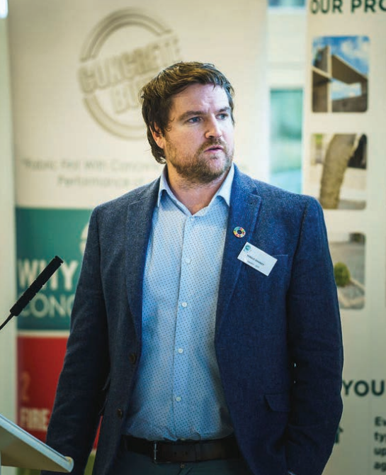
ICF AGM and Management Seminar 29th November 2022