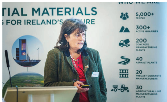
ICF Technical Seminar 25th May 2022

EN 17555- ‘Aggregates for Construction Uses’ and monitored the ongoing review of the Construction Products Regulation (CPR) and EN206.